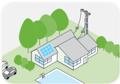
Residential backup power