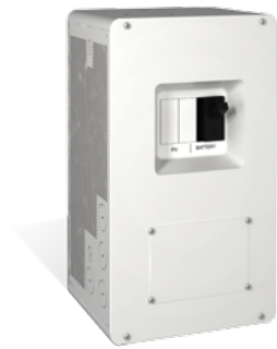
SW DC Power Distribution Panel