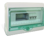
SW AC Power Distribution Panel (230 V)